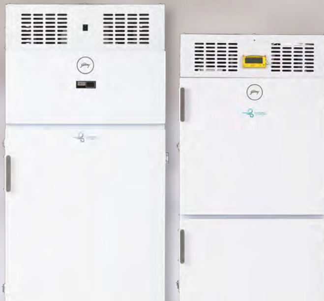
Refrigeration solutions by Godrej Appliances for vaccine delivery