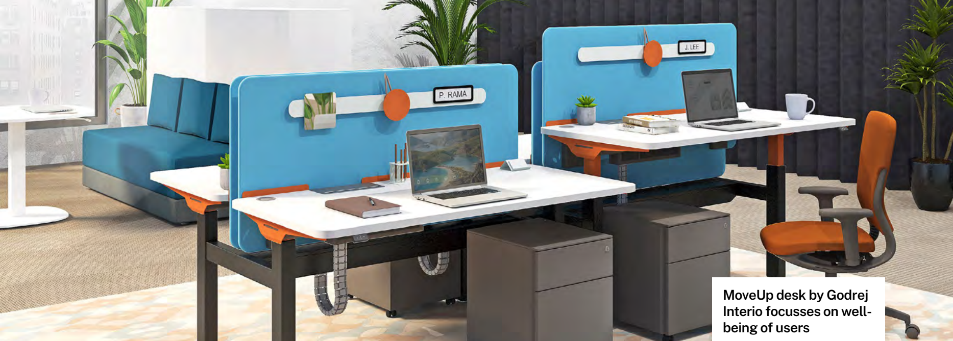
MoveUp desk by Godrej Interio focusses on well-being of users