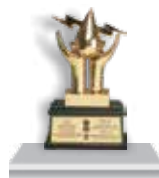
National Energy Conservation Award 2014, 15 1 st Prize Refrigerator BEE, Ministry of Power Government of India