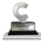
Finalist, Global Cooling Prize Rocky Mountain Institute in Association with Ministry of Science and Technology, GOI for Residential Air Conditioners