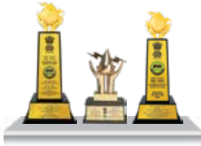
BEE - National Energy Conservation Award 2017, 18 & 19 Awarded to Godrej Edge Pro as the 'Appliance of The Year' for three consecutive years