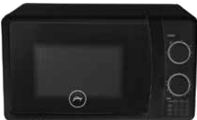
GMX 720 SP1 SW