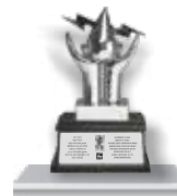
National Energy Conservation Award 2016 2 nd Prize Air Conditioner BEE, Ministry of Power Government of India