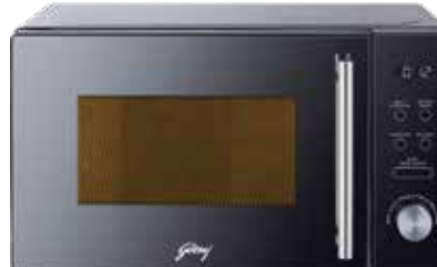
GMX 20 GA9 PLM