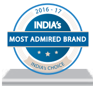
India's Most Admired Brand White Page International 2017