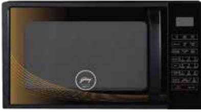
GME 720 CF2 QZ