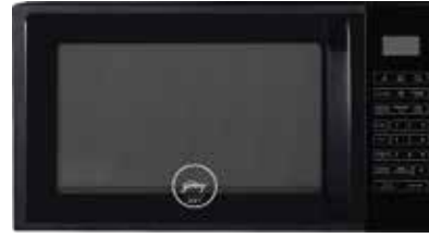
GME 720 CP2 QZ