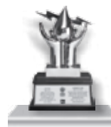
National Energy Conservation Award 2015 2 nd Prize Air Conditioner, Refrigerator BEE, Ministry of Power Government of India