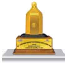
CII - Exim Bank Award For Business Excellence 2019 Awarded By CII for being a Role-model Organisation