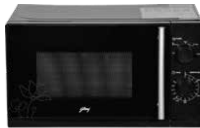
GMX 20SA2 BLM