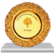
Golden Peacock Eco-Innovation Award 2016 Green Balance Air Conditioners