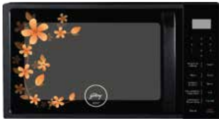
GME 720 GF1 PZ