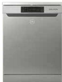
DWF EON VES 12B UI STSL SATIN SILVER

UV technology eliminates bacteria and disinfects the dishes while its built-in ionizer removes odour using negative ions.