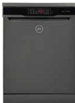
DWF EON VES 12B UTI GPGR GRAPHITE GREY

12 PLACE SETTING IDEAL FOR 4-5 FAMILY MEMBERS