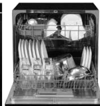
DWT EON MGNS 8C NF SKSB SILKY BLACK