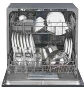
DWT EON MGNS 8C NF SKSL SILKY SILVER