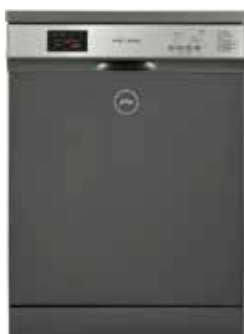
DWF EON VES 13Z STI GPGR GRAPHITE GREY

13 PLACE SETTING IDEAL FOR 6-7 FAMILY MEMBERS