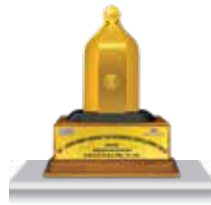
CII - Exim Bank Award For Business Excellence 2019 Awarded By CII for being a Role-model Organisation