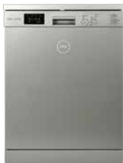
DWF EON VES 13Z SI STSL SATIN SILVER

Steam Wash Technology provides greater degree of hygiene, cleanliness and care for utensils of different shapes, sizes and materials with high-temperature, direct steam application.