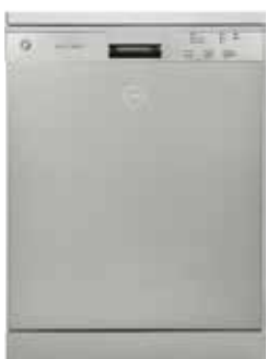
DWF EON VES 12U NF STSL SATIN SILVER

12 PLACE SETTING IDEAL FOR 4-5 FAMILY MEMBERS