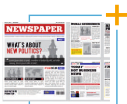
Newspaper & Magazine