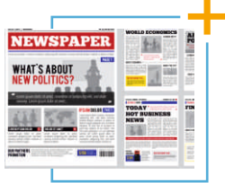
Newspaper & Magazine