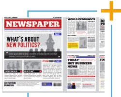
Newspaper & Magazine