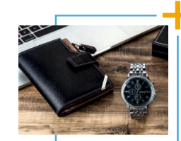
Daily used items