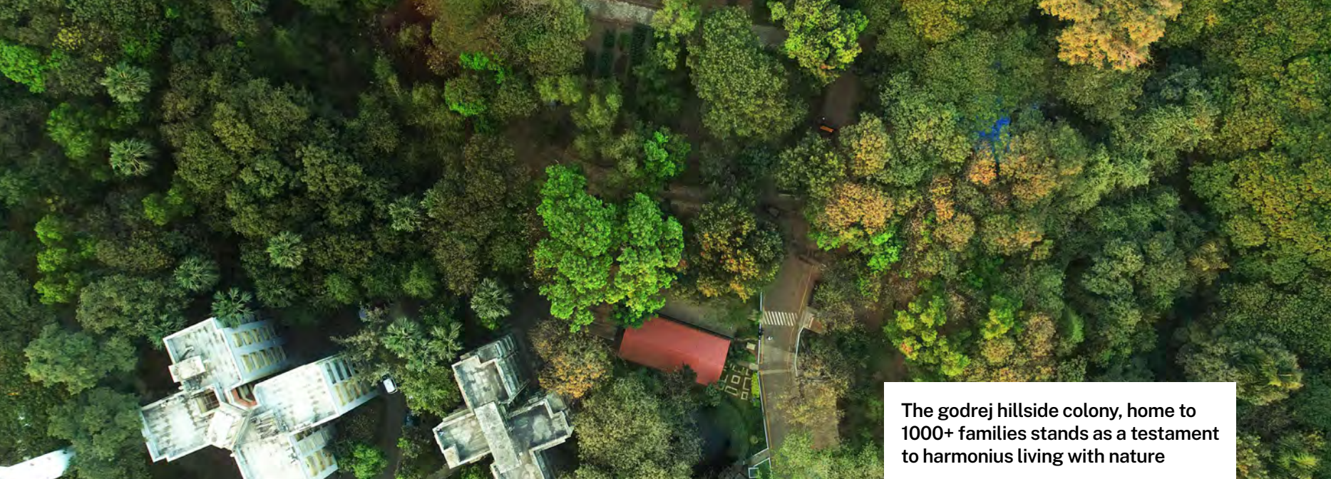
The godrej hillside colony, home to 1000+ families stands as a testament to harmonious living with nature

Godrej & Boyce Manufacturing Company Limited (G&B) provides a variety of commercial services. Our primary activities are construction, engineering, and manufacturing of consumer durables, aerospace, defence, logistics, technology, healthcare, tooling, process equipment, material handling, locking and storage solutions. With over 15,000 dedicated employees working across 14 diverse businesses, we offer high-quality consumer, office and industrial products and services in India and around the world.